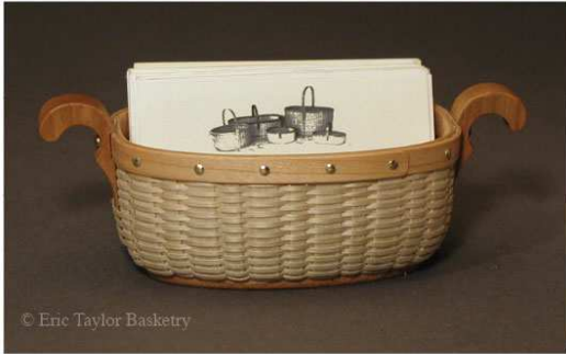
Cottage Business Card Holder 4 ½"(l) x 2 ¼"(w) x 2"(h)