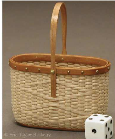
Mini Cottage Wine Tote

The mini Cottage Wine Tote was the first basket introduced of the series in 2005. This basket incorporates the same diamond twill as its larger counter part.